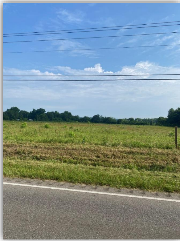
2.5 Acres on Hwy 14